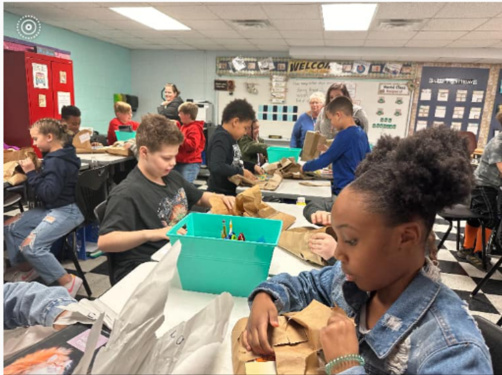
Students at Mabscott Elementary School in Raleigh County unwrap their Book Bundles.