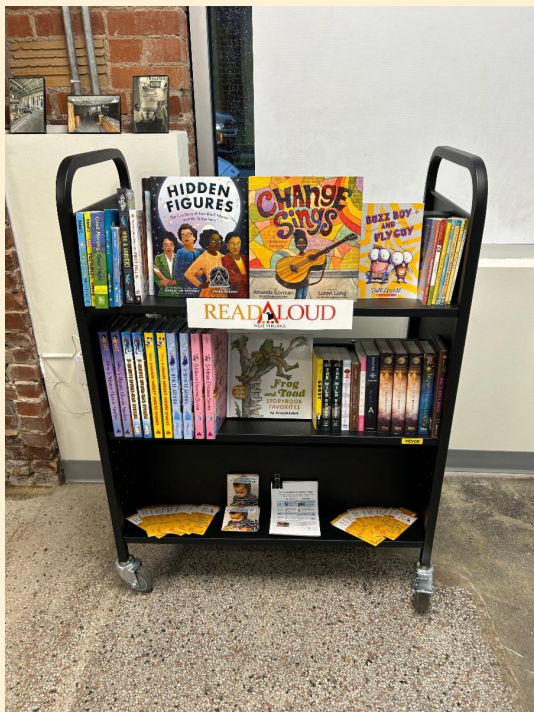
Above: The new Read Aloud WV cart offers high-interest books to families. Below: Locals walk through the store during its grand opening.

As childhood literacy is one of Dural's strongest passions, he invited us to set up a small free library in the market for kids to take a book home whenever they visit.